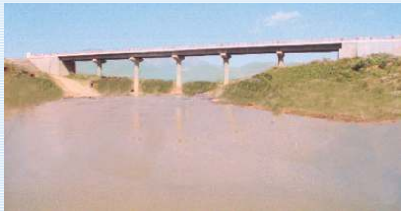
Construction of Bridge across Diguduputtu Gedda on the road from Paderu-Aruku R&B to Kamayyapeta, Vishakapatnam