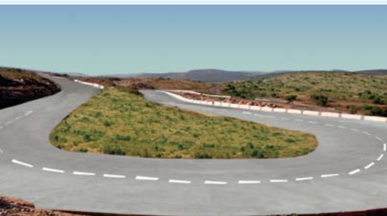
Formation of new Ghat Road from Km 16/0 of Pulivendula-Ambakapalli-Murarichintala in Kadapa District.