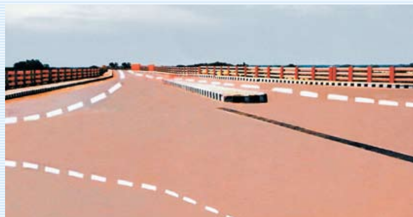
Construction of ROB at Kovur Gate in Lieu of L.C. No. 119 at Railway Km 176/12-15 in Nellore District. Andhra Pradesh