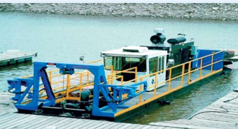
Dredging of Romperu Right Arm Guntur Dist., Andhra Pradesh