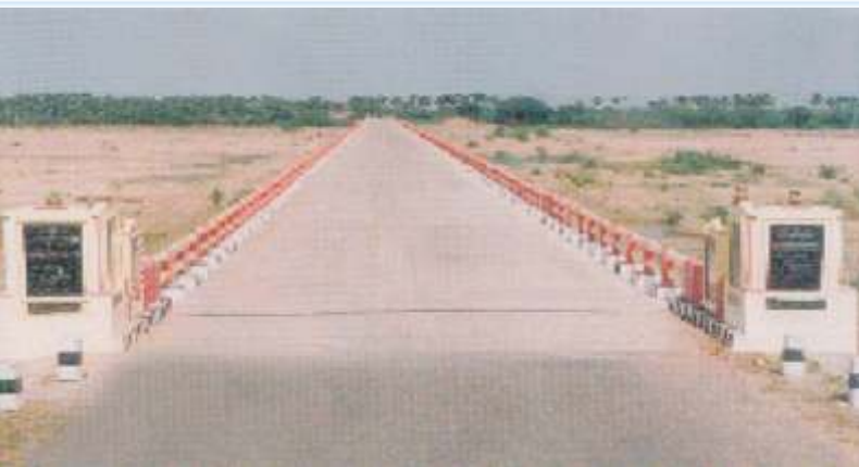
Construction of cause way across River Krishna in Km 1.40 to 2.00 of Pesarlanka - Kothurulanka Road in Guntur District