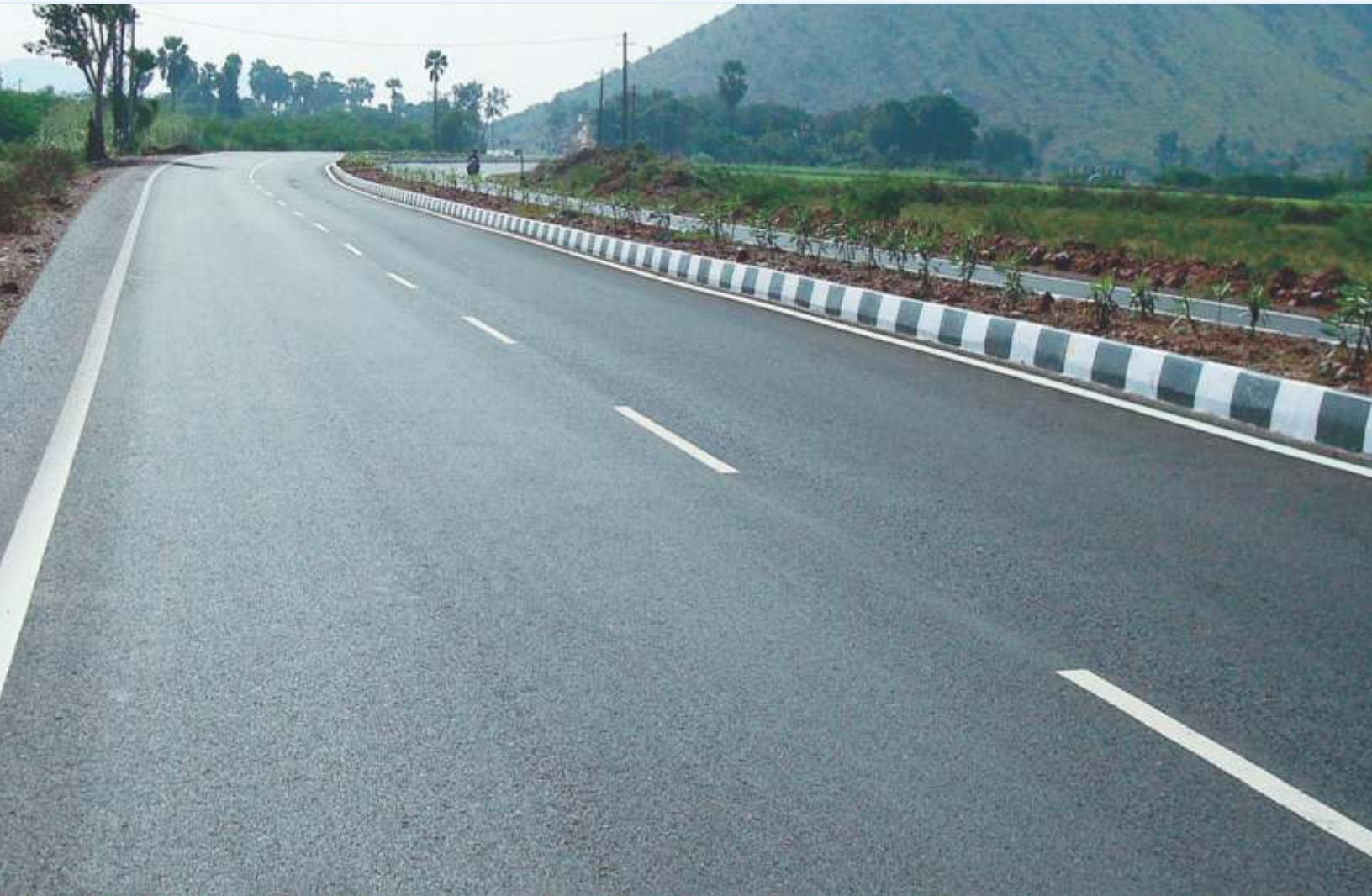
Kadapa - Pulivendula Road (KP-3) from Km 28/000 to 46/200