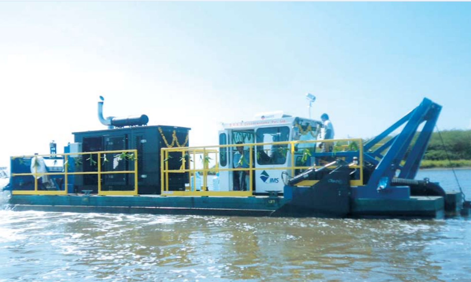
Dredging of Pedalanka major Drain, Krishna District, Andhra Pradesh