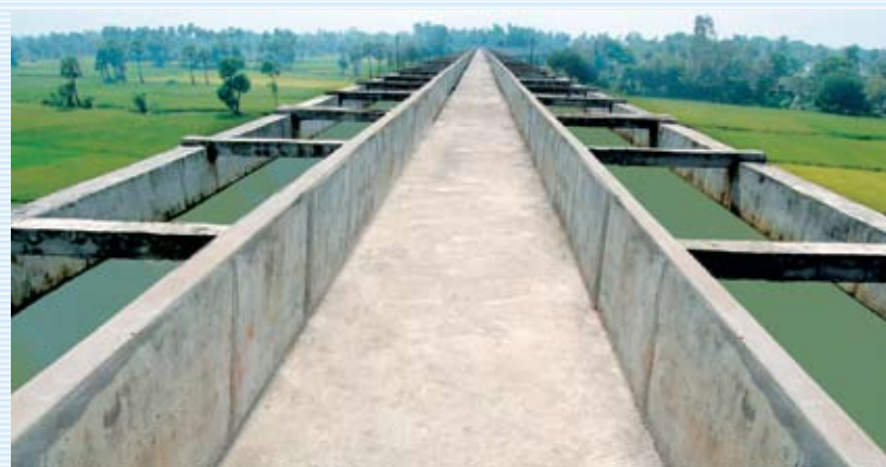
Construction of Viaduct from km 36.062 to 38.262 of Right Main Canal of Vamsadhara Project, Srikakulam Dist. A.P.