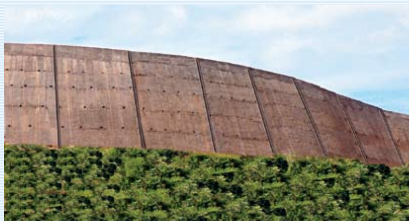
Retaining Wall Formation of Ghat Road from Km 16/0 of Pulivendula - Ambakapalli - Murarichintala Road to Join Mudigubba in Kadapa Dist., A.P.