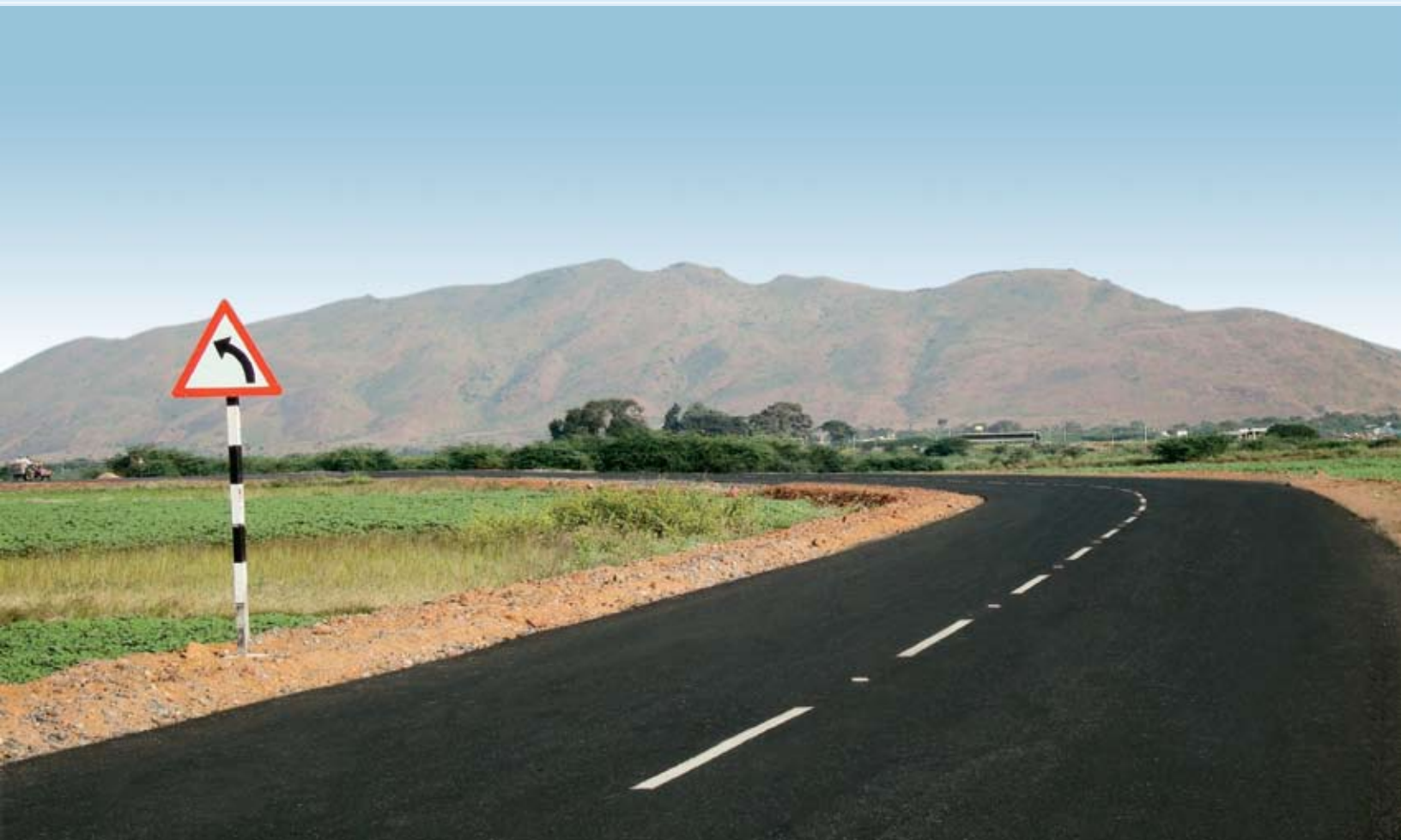
Pulivendula-Ambakapalli-Murarichintala Road (PAM) from Km 5/2 to 16/0, Kadapa District, Andhra Pradesh