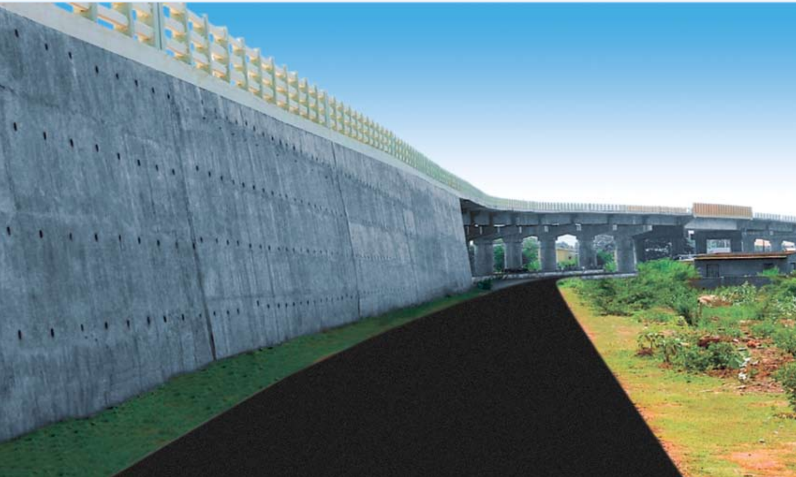
Construction of ROB near Ayyappa Gudi in Lieu of 110 at Railway Km 166/22-24 in Nellore District, A.P.,