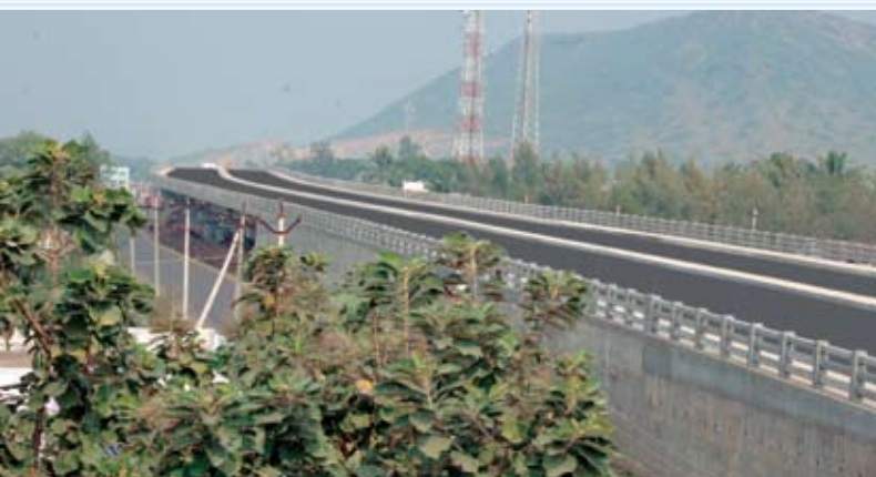
Construction of ROB at Lankelapalem in Visakhapatnam District