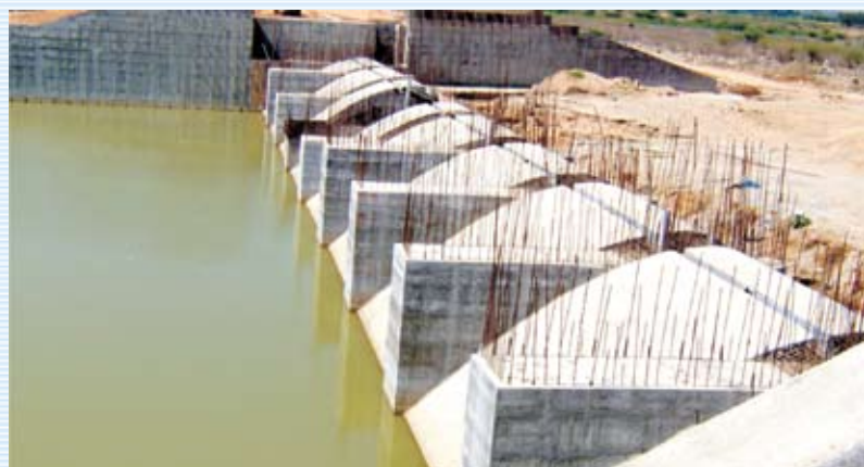
Construction of OGEE spillway from 0.668 to Km 0.834 and formation of left Earth Dam km 0.555 to Km 0.648 across Maganur Vagu near Sangambanda (V), Mahaboobnagar District., Telangana