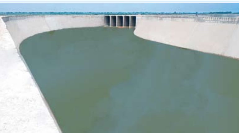
Aqueduct across Pedavagu in Flood Flow Canal of Sriram Sagar Project, Karimnagar Dist. Telangana